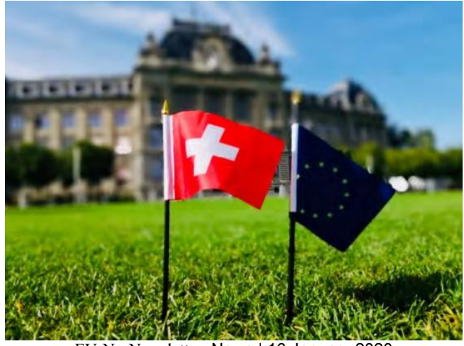
EU-No-Newsletter, News | 16 January 2020

Home /EU-No-Newsletter, News/Swiss research institutions can be instrumentalised