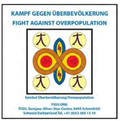
Original symbol overpopulation

http://alles-schallundrauch.blogspot.com/2020/02/gluckwunsche-die-briten-fur-den-brexit.html#ixzz6CxxSUkYN