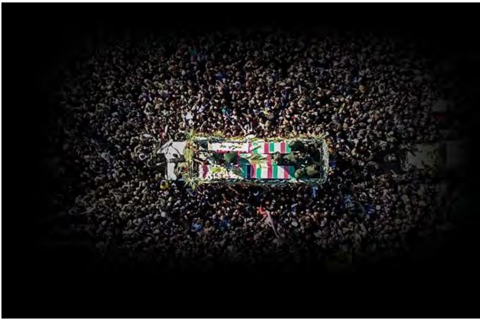
Funeral service of Qasem Soleimani in Ahvaz, Iran on 5 January 2020.

"The German government must stop slowing down the efforts of other states to effectively curb Iranian expansionism," demanded the Mideast Freedom Forum Berlin (MFFB) as early as 2008. The NGO initiates conferences and acts as "advisor" to the press, government and parliaments. 1 The MFFB, which cooperates with think tanks such as the American Enterprise Institute financed by ExxonMobil and other large corporations, never tires of emphasizing the "impossibility of dialogue" with Iran - although the country is entangled in conflicts in Syria, Yemen and Lebanon, it has never waged a war of aggression. And even though the MFFB board sends out unmistakable messages such as "The Iranian bomb must be prevented by all means", its PR events, known as "educational seminars", are supported by the German government.