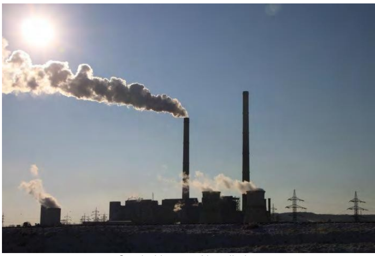
Symbol image: Air pollution

The concentration of the climate gas carbon dioxide in the atmosphere has exceeded the barely tolerable threshold of 350 ppm (parts per million), the ratio of co2 molecules to the remaining particles, for many years. The measuring station on the 3800-meter Mauna-Loa in Hawaii reported a peak value of 405.51 ppm in early October 2018. The natural value fluctuated on average between 180 ppm in cold periods and 300 ppm in warm periods. Before the great industrialization of 1870, it was 288 ppm. If all fossil fuel reserves were burned, the co2 content could probably reach 5000 ppm in 280 years, five times as high as in the days of the dinosaurs - and it was an average of 8 degrees warmer than today.