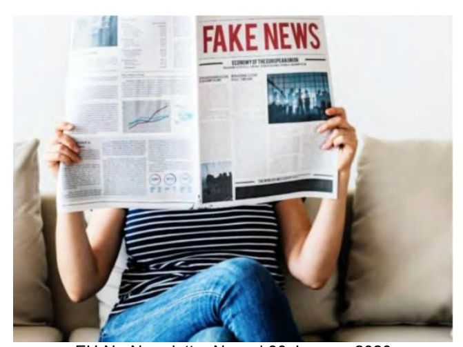
EU-No-Newsletter, News | 30 January 2020

Home /EU-No-Newsletter, News/Obvious scaremongering by trade associations