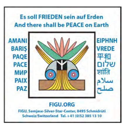
The symbol of peace

(wrong peace mbol \Phi = Celtic death rune (turned down "life rune")