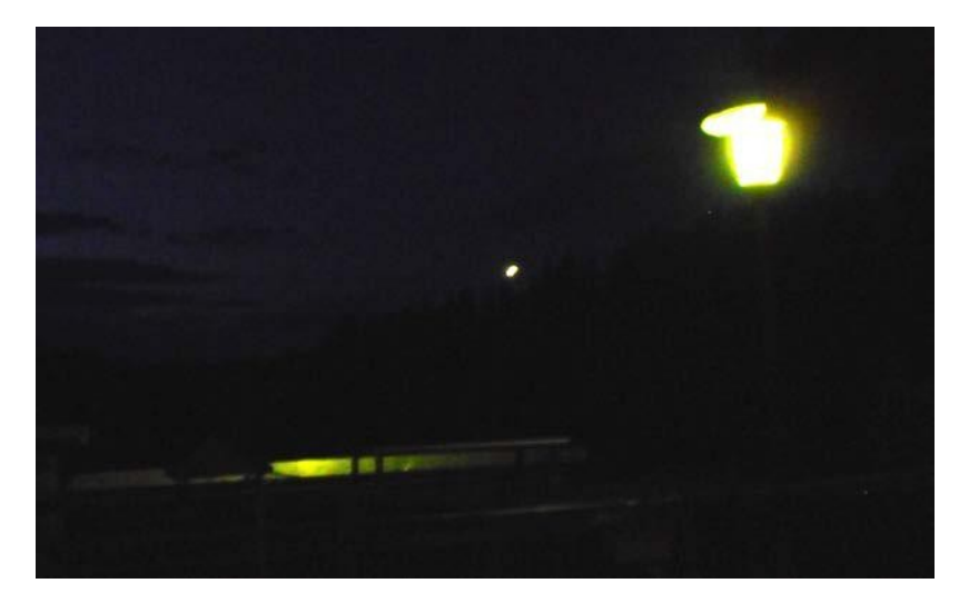
Photo below: Minicam COOLPIX: North direction; foreground the bird feeding place; right yard light; June 9, 2019, 22:17 hours, behind the center, Unidentified flying object.

Both times, 23 and 25 May 2019, the object flew silently from west to east