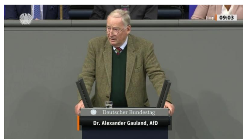
Gauland for birth control in Africa - "Population explosion is the biggest environmental problem

If you really want to do something for the climate, you have to look at the population explosion in Africa.